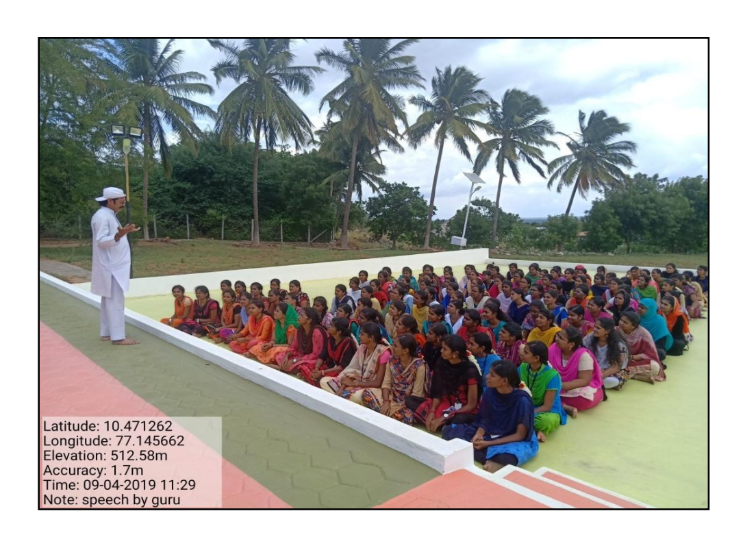
Sri GVG Visalakshi College for Women, Udumalpet.